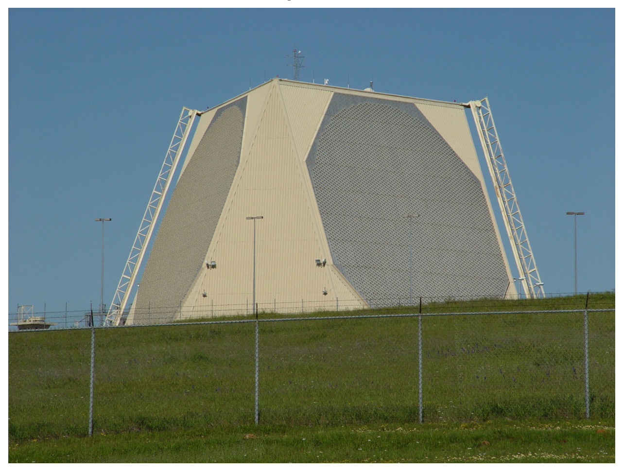
A space surveilance radar at Beale Air Force Base, Northern California. Public-domain image.